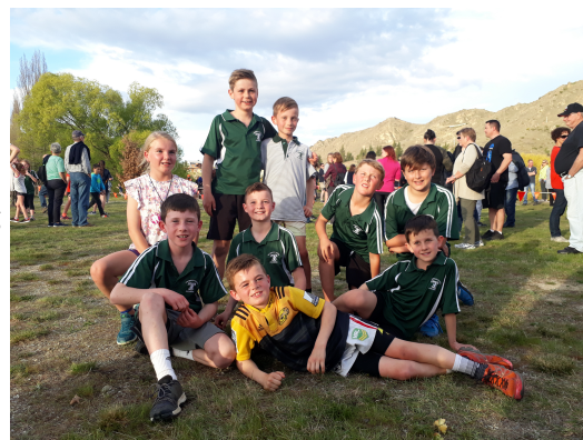
Terrace Torpedos after race to the clock