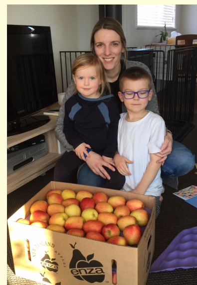
Apples delivered to the two winning entries from our Board of Trustees survey. Thank you to everyone who took part.